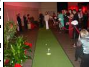
Player attempting to "make the cut" at Gala Fundraising event in Tampa.

We bring the green to your event, set it up and conduct a hole-in-one competition. You sell a sponsorship for the competition, advance "tee time tickets" or at the door "green fee tickets". Ticket holders are given three attempts to make a 15' putt to "make the cut" for a chance to putt for a hole-in-one and win the Grand Prize.