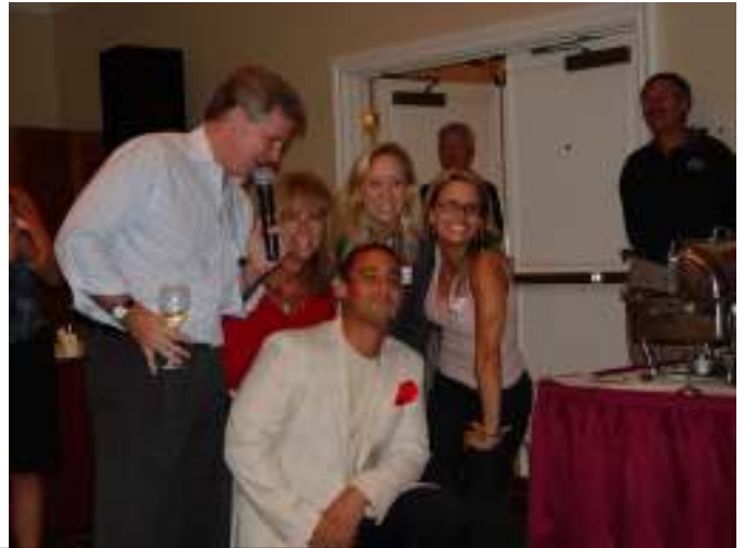
CENTRE CLUB-TAMPA WINNERS ↑