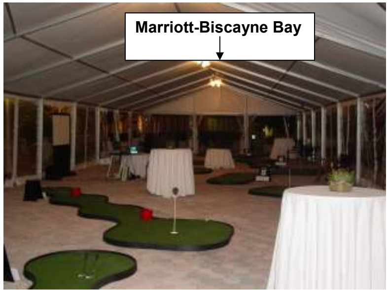
Marriott-Biscayne Bay ↓